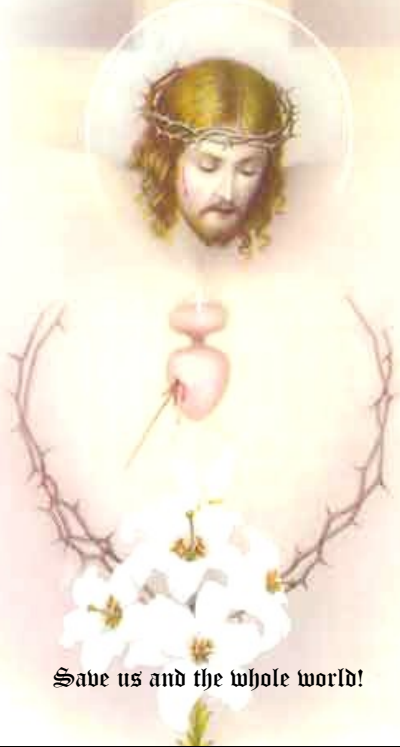
Save us and the whole world!